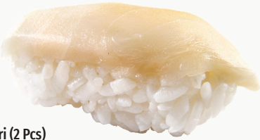
Nigiri (2 Pcs)