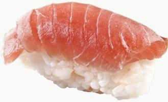
Nigiri (2 Pcs)